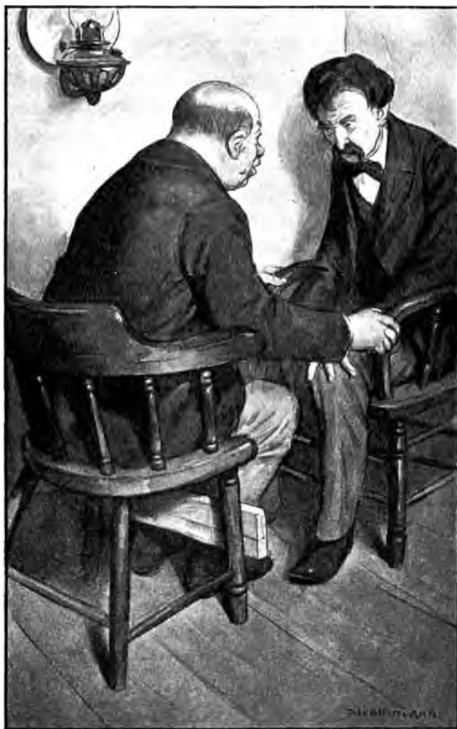
"BACKED ME INTO A CORNER"